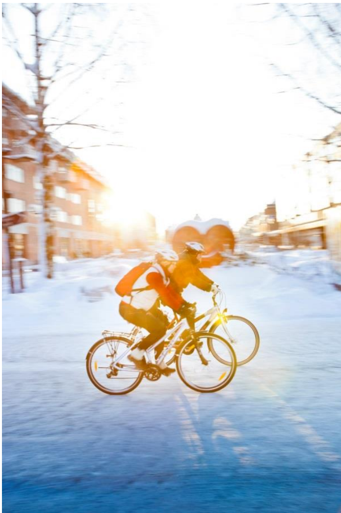
Figure 3: The cold and snowy winter city Umeå is used by outdoor loving citizens on skis, skates and here bikes – actively contributing to better air quality and public health and reduction of CO2 emissions.