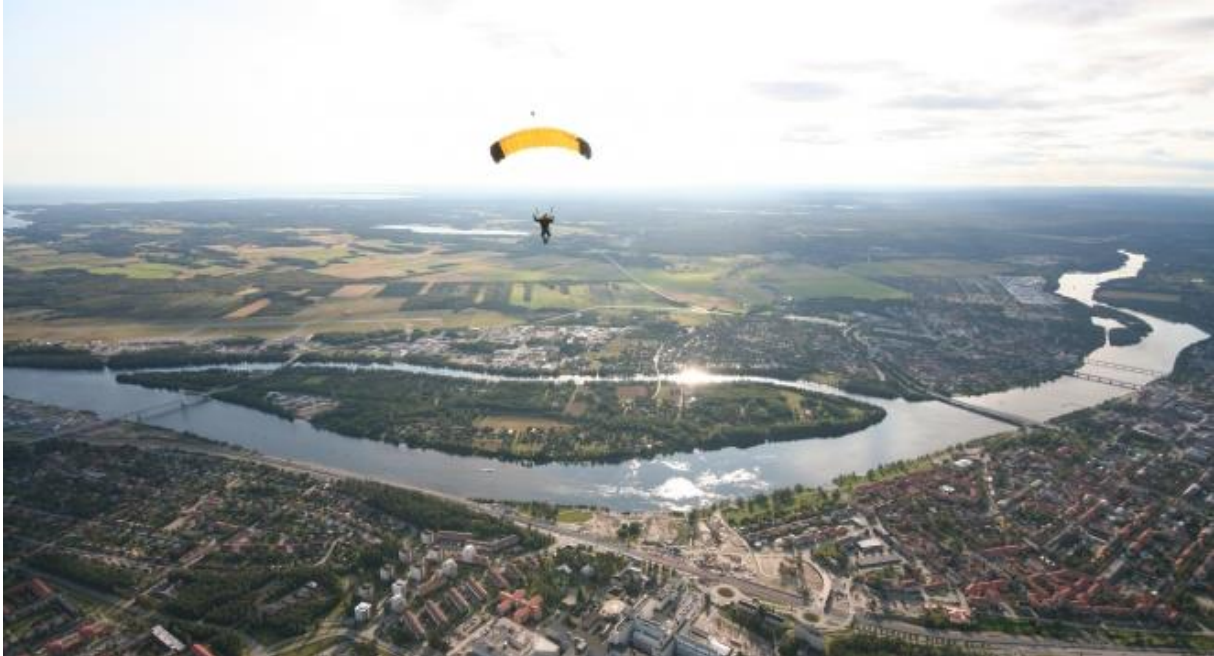
Figure 1: Umeå viewed from the north with Umeälven (Ume River), Natura 2000 area river delta and its plains, forests and the sea in the background

Umeå with 120 000 inhabitants is the centre of growth in northern Sweden, doubling its population over the last 50 years and making it one of Europe’s fastest growing cities in an otherwise sparsely populated region. One of the City Council’s seven strategic long-term objectives states that Umeå’s growth is reached with social, ecological and economic sustainability, aiming towards the vision of 200,000 citizens in 2050. Thus, sustainable growth is both the challenge and the opportunity for Umeå.