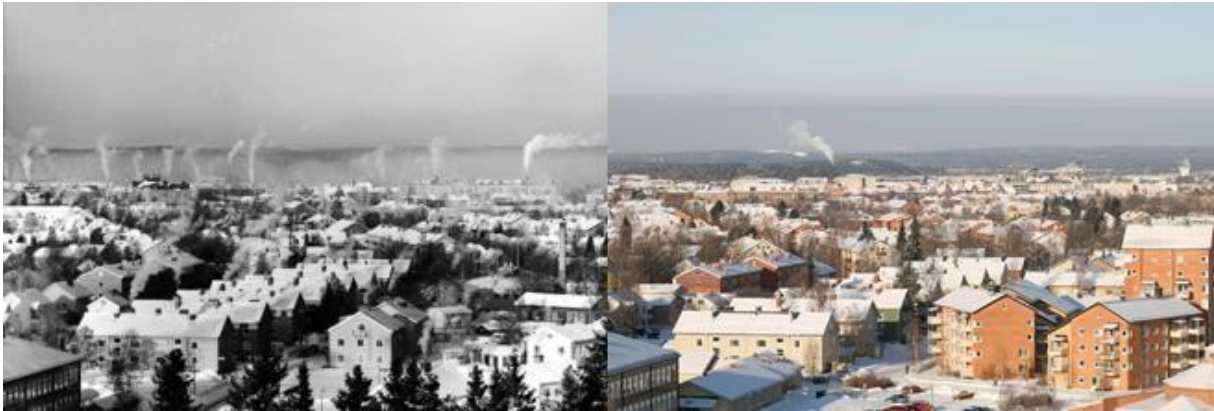
Figure 4: Umeå - a cold winter day in 1960s and in the 21st century - changing the city skyline over 50 years of systematic investment in a renewable district energy system

The city's growth took off in the 1950s and 1960s with one key element being the establishment of Umeå University. Parallel to this growth, the city made systematic INVESTMENTS in sustainability; both long-term socio-cultural investments in areas such as culture, gender equality and public health promotion, but also in green infrastructure such as a city-wide co-generation district energy system, co-owned hydro-electric power plant, green infrastructure, clean water supply etc.